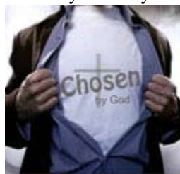
RECLAIMING YOUR IDENTITY Bible Study

A life of obedience and holiness (I Peter 1:14-16). This again is not what saves but what God's chosen are called to do. We are a holy people. In the Old Testament the temple was holy – it was different from ordinary buildings. The Sabbath day was holy – it was a different day from all the rest. The Christian is